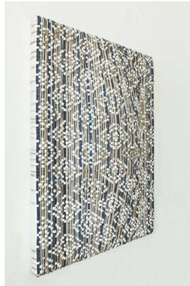
COVER Prelude 1, 2015, customised corner, cube reflectors and glass beads on aluminium frame, 125cm diameter x 33cm depth

RIC SPENCER · CURATOR · FREMANTLE ARTS CENTRE