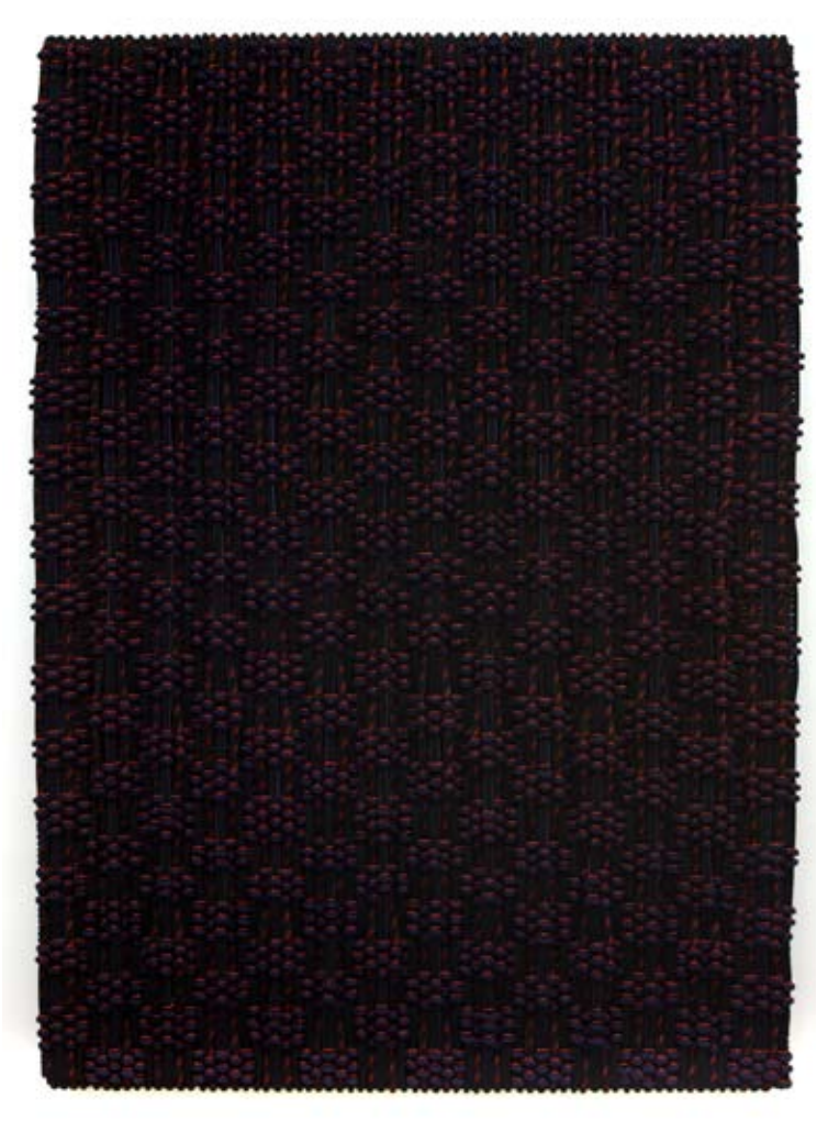
Braveheart, take 4, 2007 polyester, nylon and leather on wood 145 x 200 x 14 cm