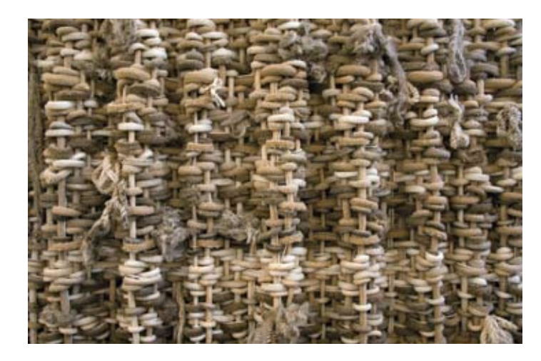
One breath below consciousness, 2008 (detail) white polyester, white nylon and soil 240 x 200 x 10 cm