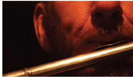
Braveheart, 2007 16:9 single channel video 17'50"