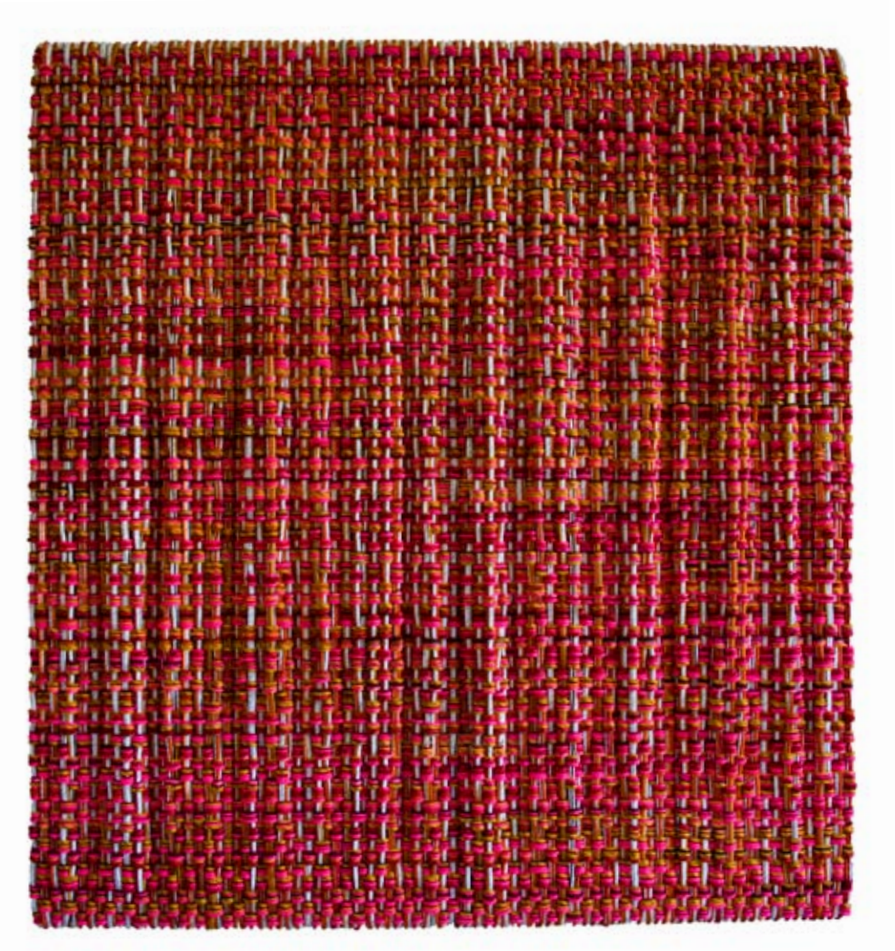
The secret life of tweens, 2008 nylon, polyester and leather on wood 195 x 205 x 6 cm