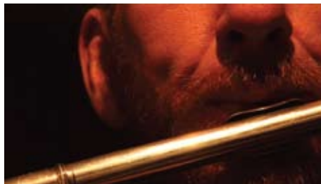
Braveheart, 2007 16:9 single channel video 17'50"