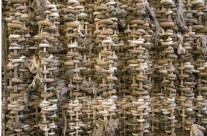
One breath below consciousness, 2008 (detail) white polyester, white nylon and soil 240 x 200 x 10 cm