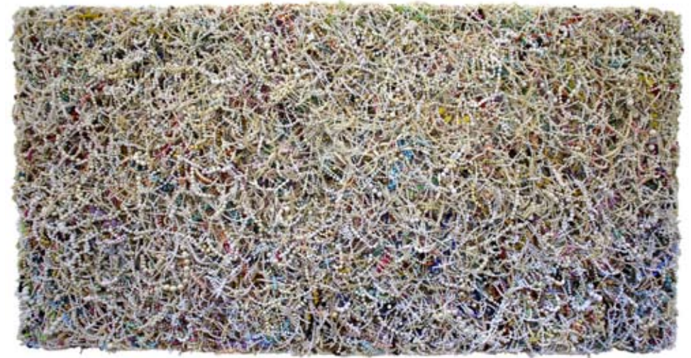
The pleasure chest, 2007 second-hand beaded necklaces and Spanish rosary beads collected between 2000 and 2003, tubular mesh used for mussel farming 255 x 130 x 8 cm