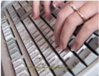
Andrea, greeted by a pubescent smile, 2007 4:3 single channel video 10'54"

Few people would admit this, but looking at art is a lot like cruising for casual sex (and not just because both tend to happen on the weekend). A common pact is signed the moment we enter a given space – usually physical, increasingly virtual – to see the goods on show. The tantalising prospect is to have our fancies tickled there and then, to be drawn into the lurid surface-world before us, to be speaking through appearance. A scan up and down the body generally suffices before we move on to the next object in the line-up. Occasionally, a broader dialogue is sparked, a yearning to spend more time with what's before us – sometimes to seek out the other's ideas, more often due to the dazzle of display. If we're really conscientious, we'll find out the prospect's name and the year of its production (who knows, we may even remember those details a few days down the track). Most often of all, though, we stagger out disappointed, deflated in the wrong way, nonetheless urging ourselves to forge on in the hope of having the right kind of encounter.