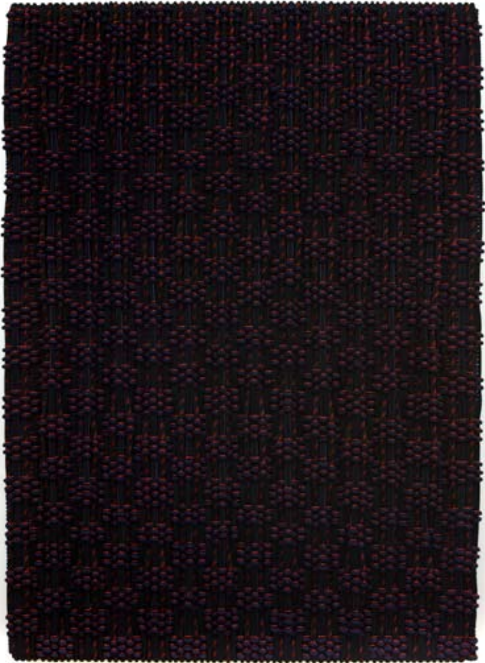
Braveheart, take 4, 2007 polyester, nylon and leather on wood 145 x 200 x 14 cm