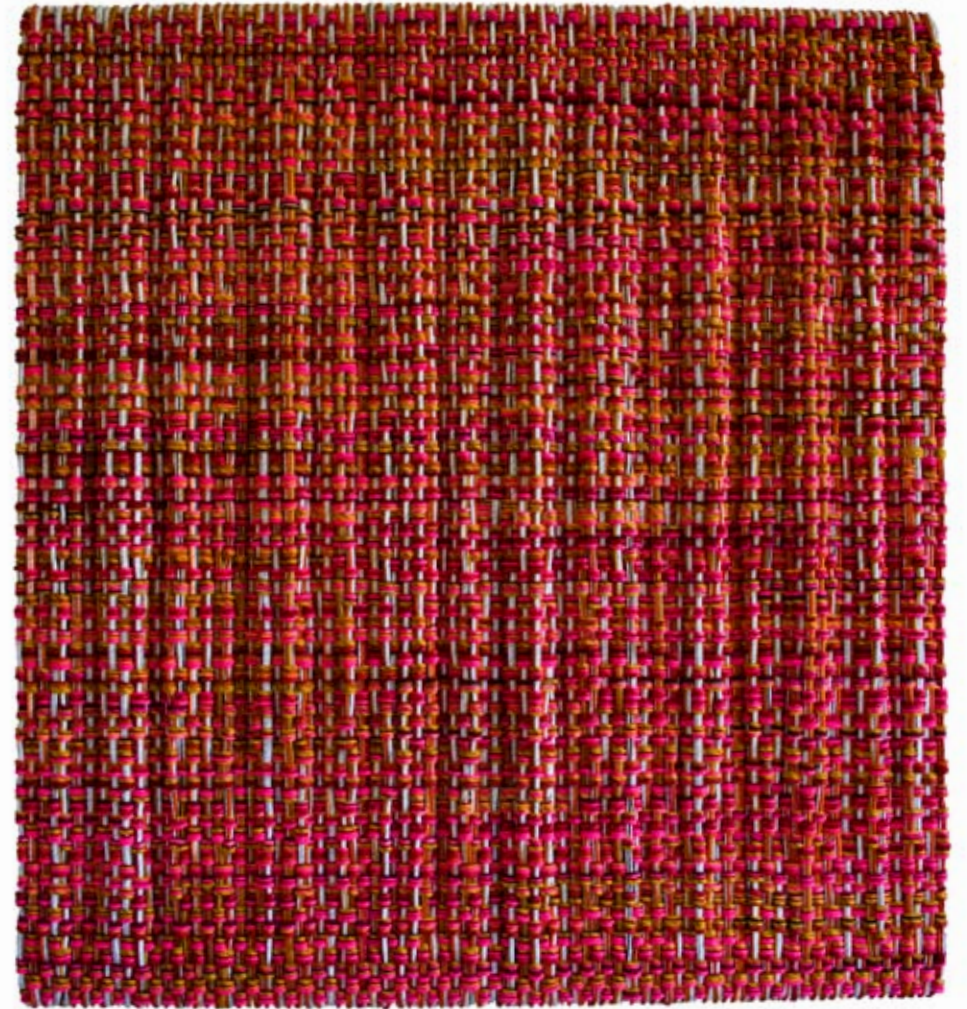
The secret life of tweens, 2008 nylon, polyester and leather on wood 195 x 205 x 6 cm