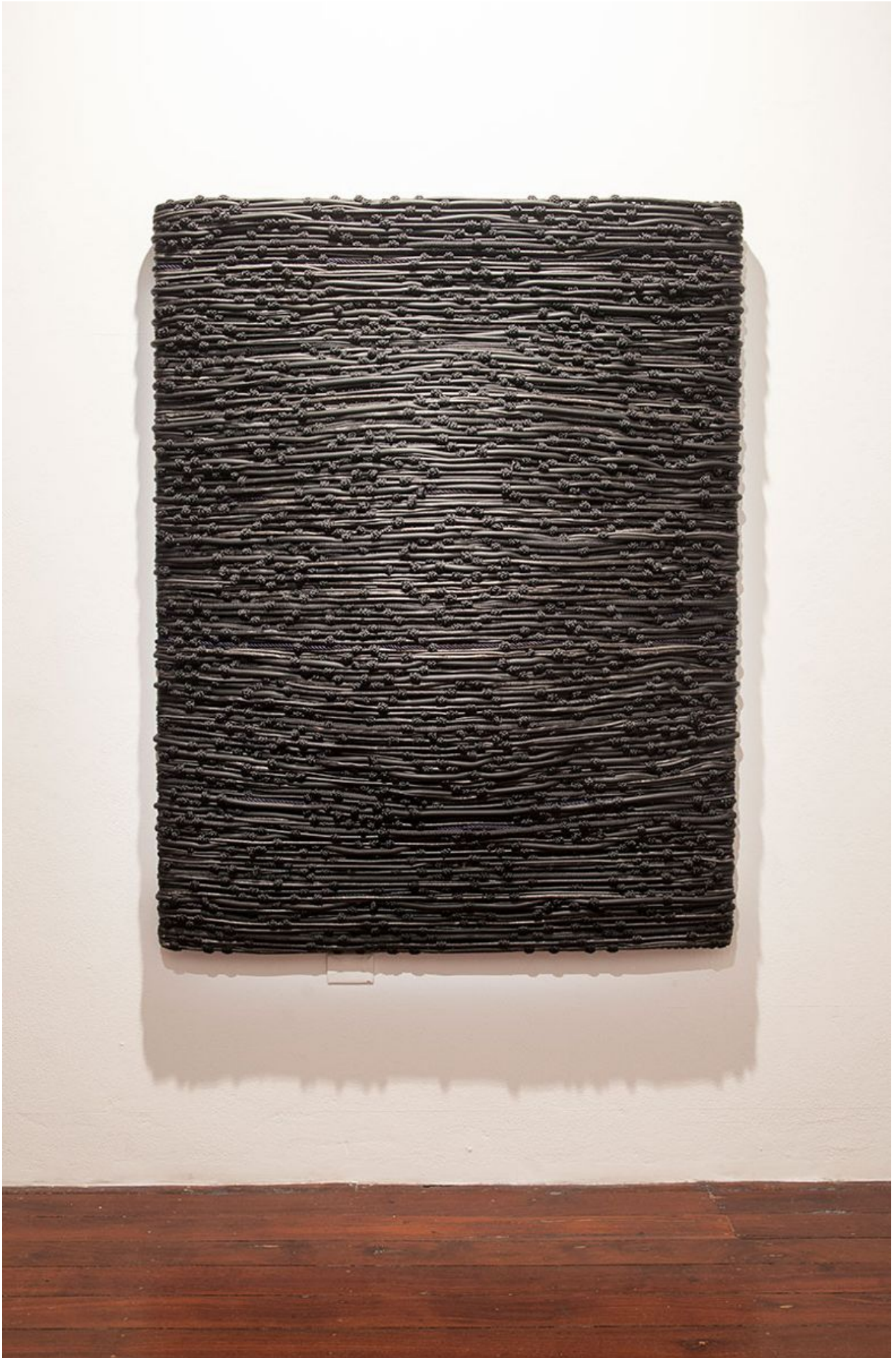
Dani Marti, Shield – Study for a Portrait – Take 3, 2015, stainless steel braided hose, polyester,