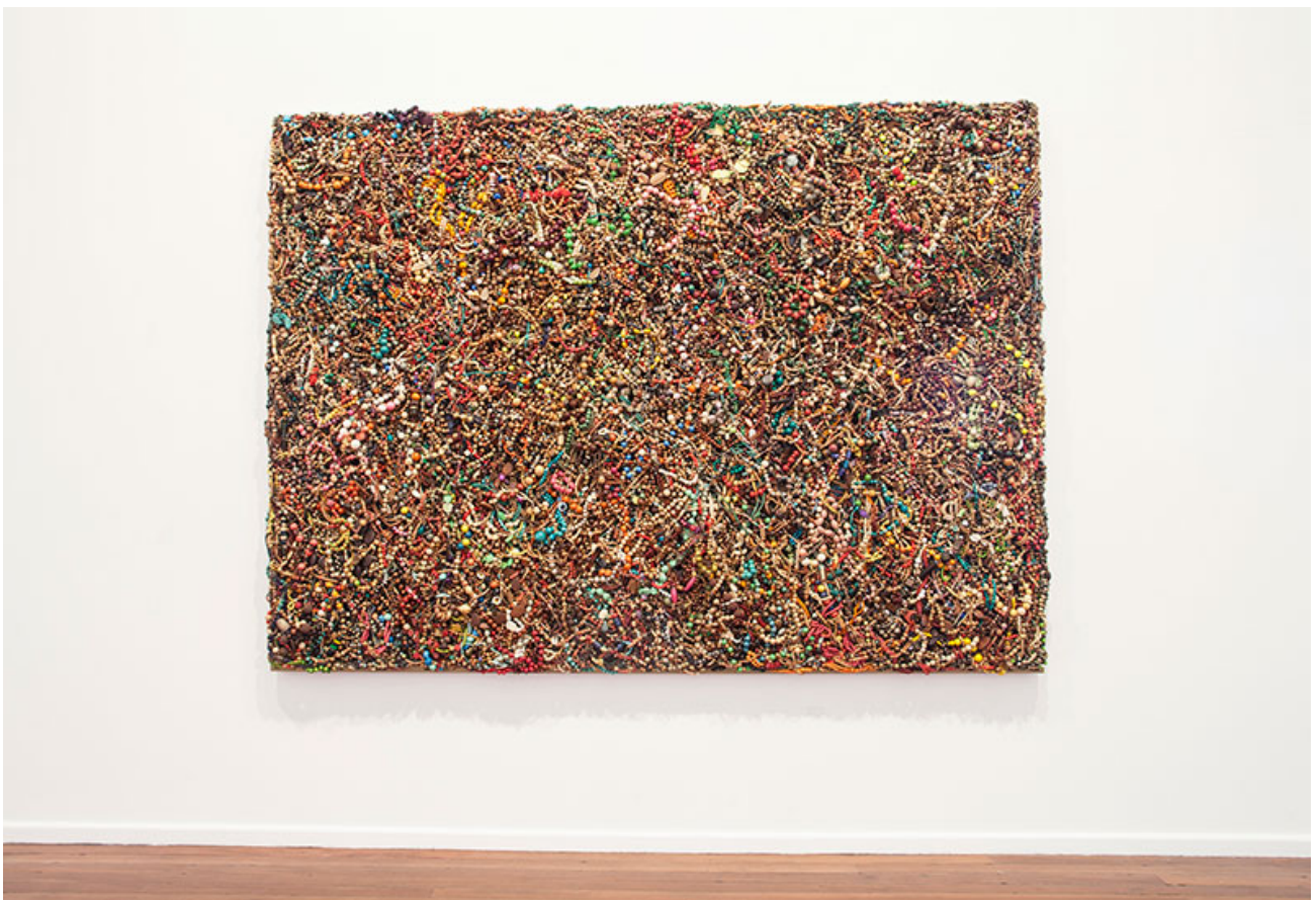
Dani Marti, The Pleasure Chest (Composition in Wood) , 2014–15, second-hand necklaces and beads on powder coated aluminium frame. Courtesy the Artist; GAGPROJECTS | Greenaway Art Gallery, Adelaide; ARC ONE GALLERY, Melbourne; and Dominik Mersch Gallery, Sydney

immersive scale at both entrance points to the exhibition. Marti uses the term “paintings” deliberately, recalling histories of hard-edged minimalism, the monochrome and also of portraiture, but their language is fundamentally sculptural, speaking of both the material and labour of their making. The looming, circular Prelude (2015) consists of a multitude of reflector cubes squeezed into curvy, florid platelets and arranged in a radial gradient of deep purple, blue-black and teal. It’s the physical embodiment of the exhibition’s title, sucking in and throwing up light. The Pleasure Chest and Mother series weave second-hand necklaces into large, intricate monochromes awash with sensations; a flash of the mean reds, an enveloping darkness, the fondling of rosary beads or a pelt of glistening skin.