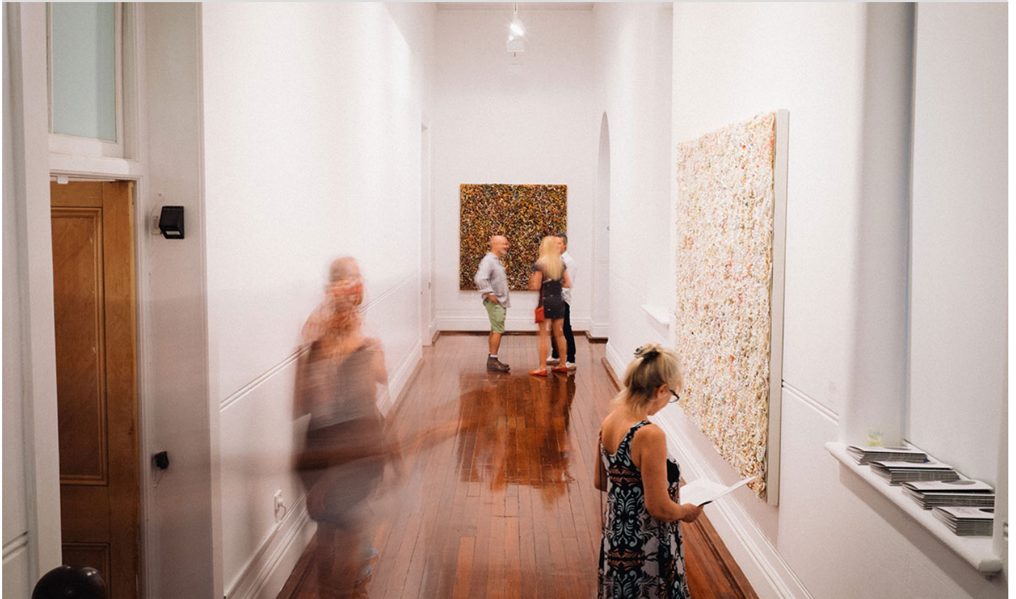
Dani Marti: Black Sun, installation view, Fremantle Art Centre. Photo: Rhianna Nelson